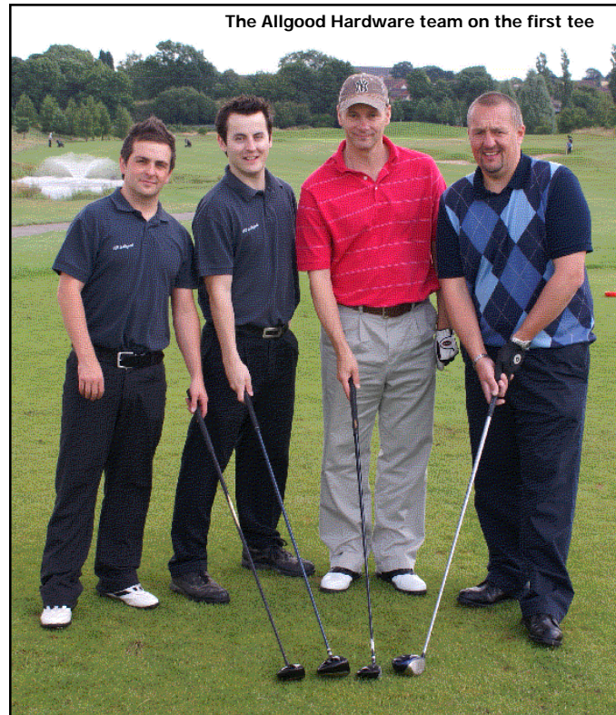
The Allgood Hardware team on the first tee

We managed to raise an incredible £9000 on the day. We would like to thank everyone who supported us and helped make the day so successful including all of the staff at Aston Wood Golf Club and we hope to see you again at our next Golf Day in July 2009.